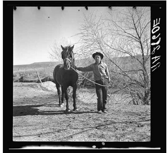
Somewhere in Doña Ana County ca. 1936

annual banquet. The membership meetings begin again in February and continue through May. The meeting location is the Good Samaritan Auditorium 3011 Buena Vida Circle. They are free and open to the public. Please email questions or comments to 19dachs69@gmail.com or send them to DACHS PO Box 16045 Las Cruces, NM 88004.