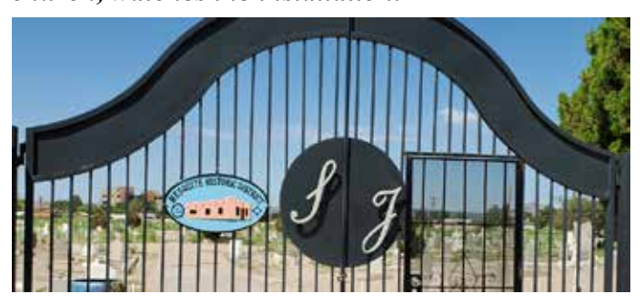
The outer gate to the San Jose cemetery.