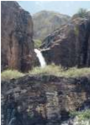
Dripping Springs when it was running (July 6, 1999)