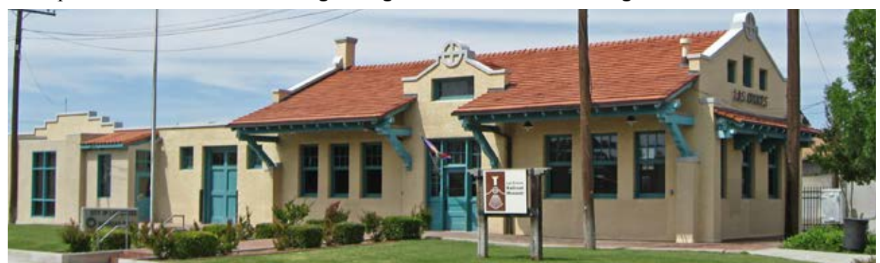
Las Cruces RR Depot/Museum at 351 N. Mesilla St. Walking tour begins at 5:30 pm, May 11

No reservations are required. You might want to bring a bottle of water. Of course there are several watering holes in the area. ©